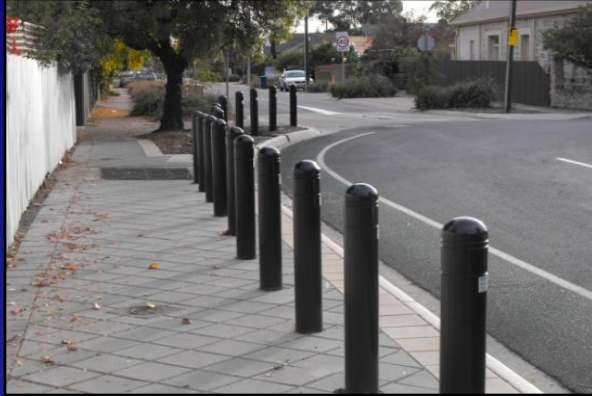
Omni Stop Bollards