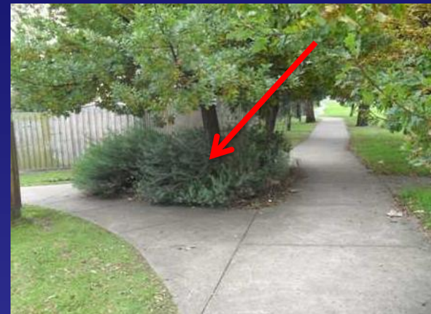
Vegetation obstructs view