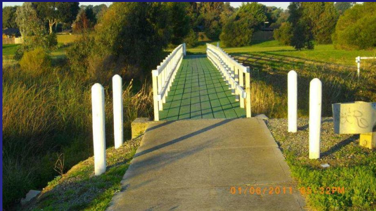
Gaps in bridge deck – trap cyclist